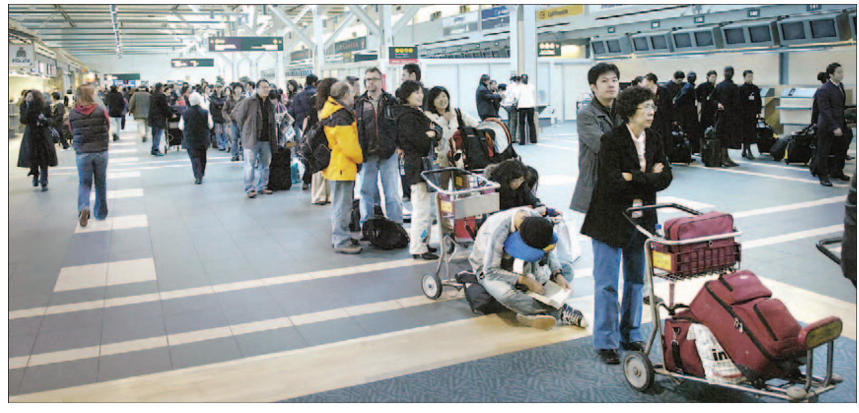
Security concerns caused delays at Vancouver airport Friday as international passengers had to wait in a line that spanned the terminal.

The man chose the latter option, Tabunar said, but then he proceeded through the screening area without being rescreened. Although it seemed a simple mistake, airport officials