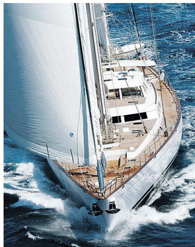
To sail "extremely powerful" yachts like Ron Holland's 58-metre Ethereal, "You've got to know what you're doing," Rupert Murdoch said.