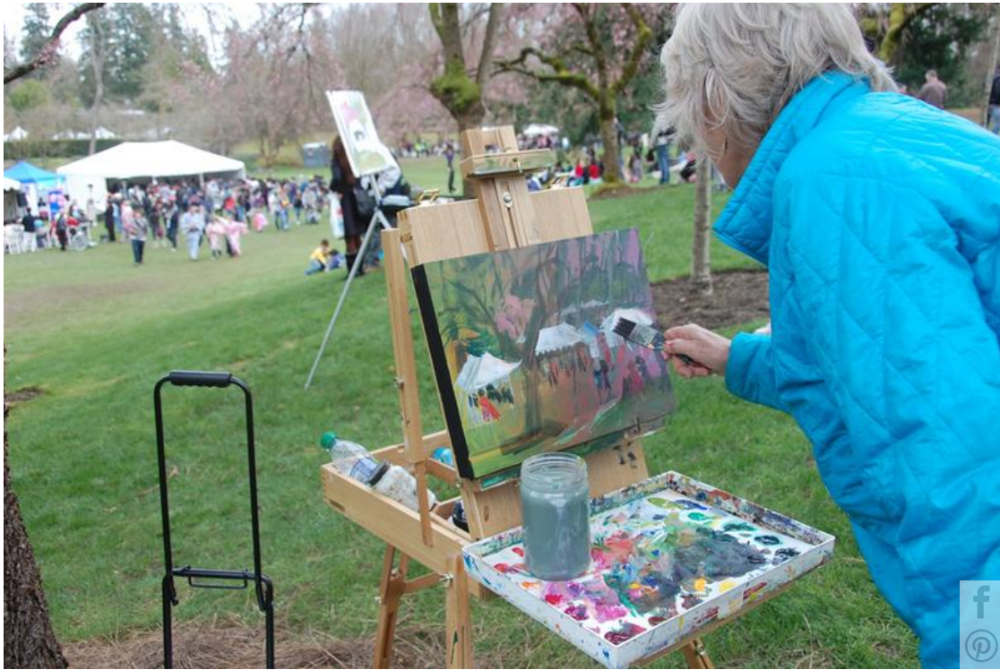
Joseph Lin/ VCBF

On April 20th, bring your sketchbook and painting supplies to VanDusen Botanical Garden for the Plein Air Paint Out & Picnic . Visitors will get to explore the garden, create and watch artists paint their cherry-blossom-inspired masterpieces.