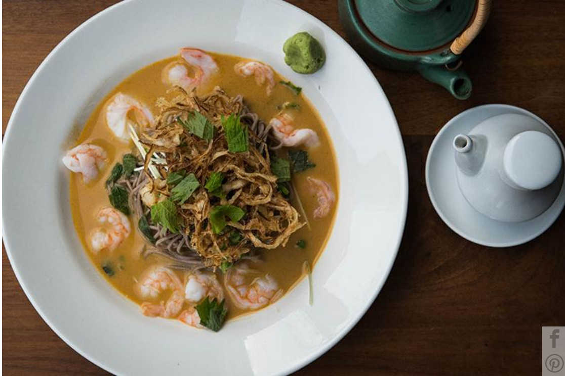
Hapa Izakaya/ VCBF

Dress in pink-tie attire for Sakura Night . Seven of the top restaurants in Vancouver, including Hapa Izakaya , Benkei Ramen and Masayoshi , are showing off their Asian-fusion cuisine and superb culinary skills at the newly renovated Stanley Park Pavilion in celebration of the Cherry Blossom Festival .